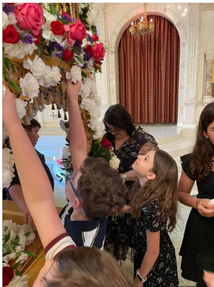
Decorating the Kouvouklion