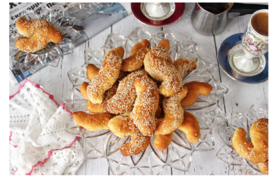
Koulourakia with orange are a Greek vegan cookie. perfect for dunking! 43 --

baking Lenten koulourakia and will have them for sale April 7 after church. Thanks for supporting the MAIDS.